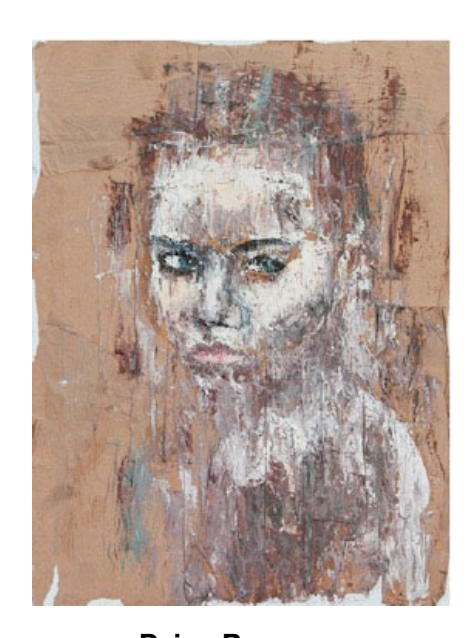
- Paige Brunson